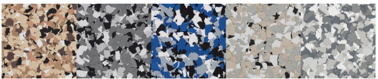
Outback 1/4" Wombat 1/4" Orbit 1/4" Cabin Fever 1/4" Stonehenge 1/4" FB-517 FB-616 FB-310 FB-127 FB-427 FB-427