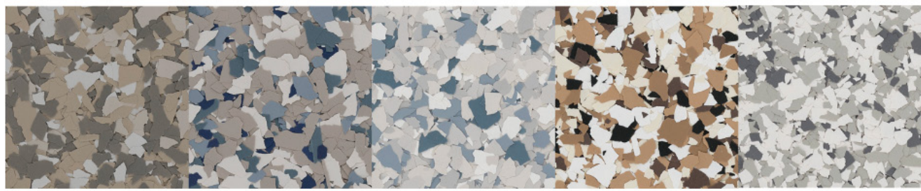
Madras 1/4" Stonewash 1/4" Tidal Wave 1/4" Bean 1/4" Snowfall 1/4" FB-706 FB-708 FB-807 FB-960 FB-602 FB-602