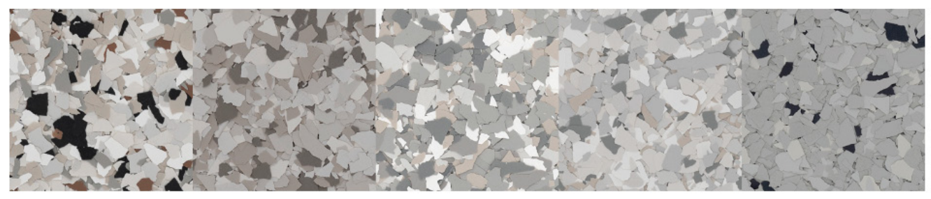
Coyote 1/4" Dovetail 1/4" Stoney Creek 1/4" Rocky Ridge 1/4" Galaxy 1/4" FB-513 FB-823 FB-806 FB-801 FB-907 FB-907